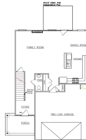
FIRST FLOOR - FARMHOUSE