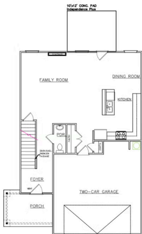
FIRST FLOOR - FARMHOUSE