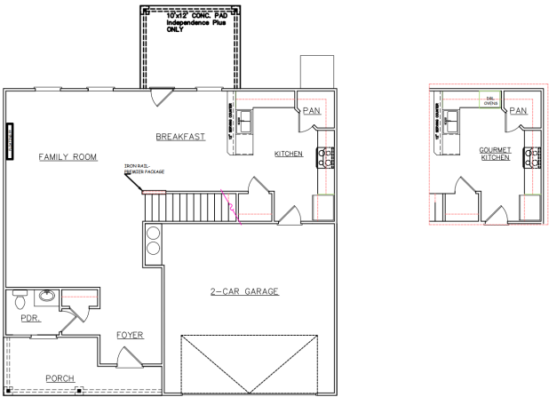
FIRST FLOOR FE