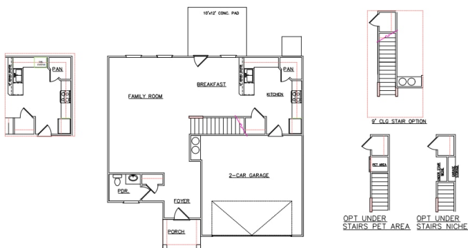
FIRST FLOOR PLAN (SCALE 1/8"=1'-0")