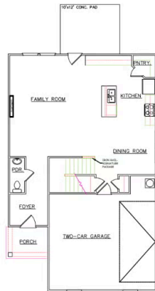
FIRST FLOOR PLAN (SCALE 1/8"=1'-0")